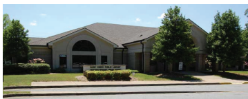
ROSE CREEK 4476 Towne Lake Parkway Woodstock, GA 30189