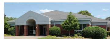
HICKORY FLAT 2740 East Cherokee Drive Canton, GA 30115