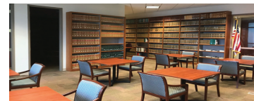
LAW LIBRARY Frank C. Mills III Justice Center, Suite 250 90 North Street Canton, GA 30114

SRLS is a three-county library system with seven branches and a law library. Gilmer and Pickens each have one branch in their county. Cherokee has five branches and a law library at the courthouse.