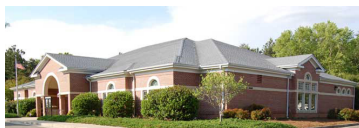
PICKENS 100 Library Lane Jasper, GA 30143