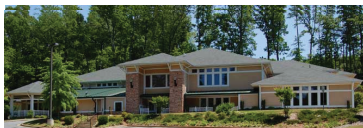
WOODSTOCK 7735 Main Street Woodstock, GA 30188

Our Pickens County Library in Jasper, located at 100 Library Lane, is currently closed to the public to prepare for an upcoming renovation and expansion. "Pickens Grab & Go" is available inside the Mountain Education Charter High School building, located at 339 West Church Street.