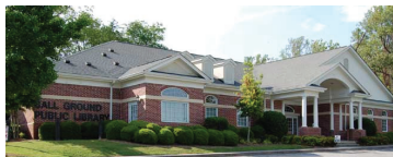
BALL GROUND 435 Old Canton Road Ball Ground, GA 30107