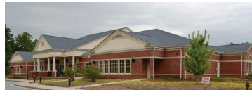
GILMER 268 Calvin Jackson Drive Ellijay, GA 30540